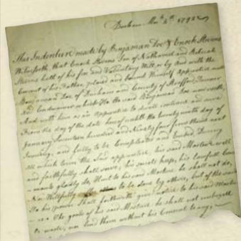
A page from Benjamin Doe's notebook — DHA Museum