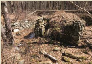
The cellar hole of the Doe farmhouse, with the foundation of the massive central chimney.