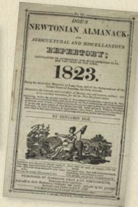
Doe's Newtonian Almanac 1823 — DHA Museum