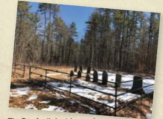
The Doe family burial ground.

Members of the Doe family who lived and died on the farm were buried about 150 feet south of the house site. There are 11 engraved stones, all dating after 1800. The earlier graves were marked with field stones, the common practice on farms before the 19th century. The town installed an iron pipe fence in 1916.