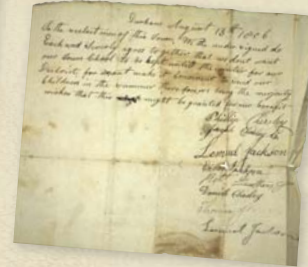
1806 North District Parents' Petition to Postpone School — DHA Museum