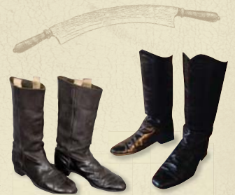
Cowboy boots - mid 19th century