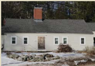
There are no known images of the Doe farmhouse. Shown above is the 'David Davis house' in Durham. Built c.1710, it is a full-Cape style with no shutters or dormers. It gives a fair idea of what the original Doe farmhouse probably looked like.

The Doe farmhouse was a full Cape style with a massive central chimney, its foundation can be seen in the cellar hole, in the woods just beyond the kiosk.