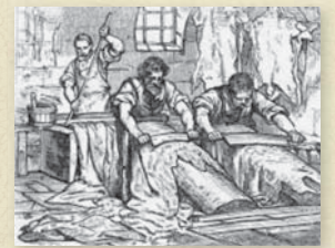
Scraping hides, one step in the process of tanning hides and skins