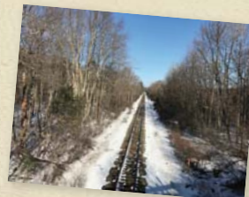
Passenger rail and freight trains pass daily on the tracks bordering Doe Farm.