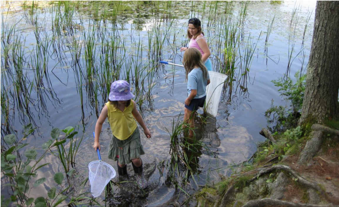
What can dragonflies teach us about the river?