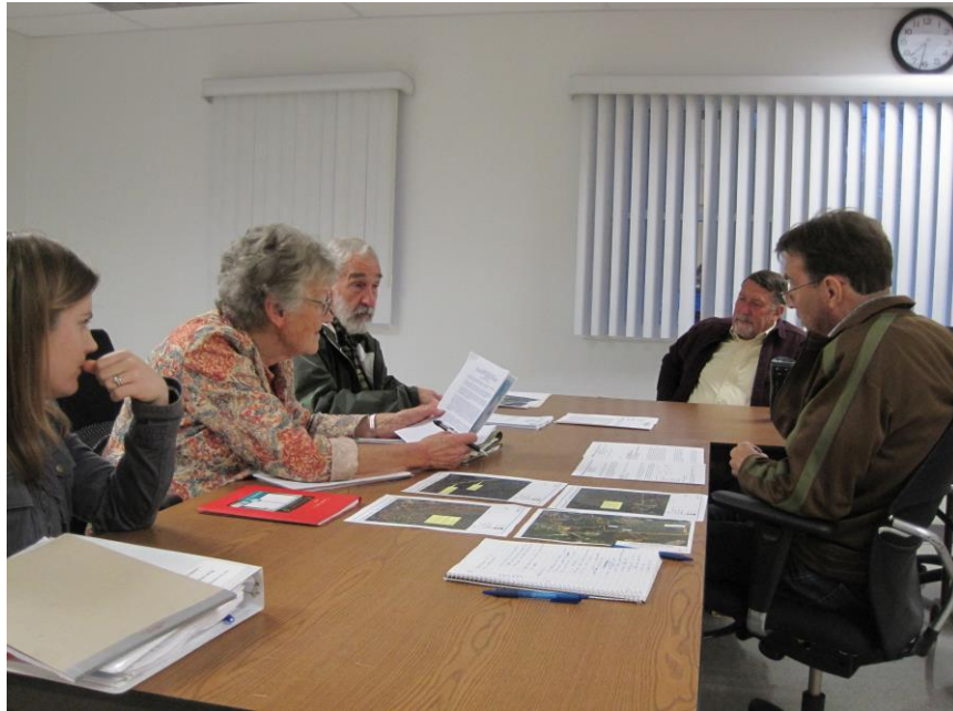
The subcommittee reviews plans, photo by S. Petersen.