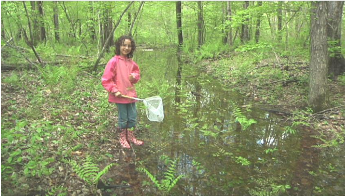
Future land steward enjoys the floodplain on conserved land in Lee, photo by Breakaway Media.