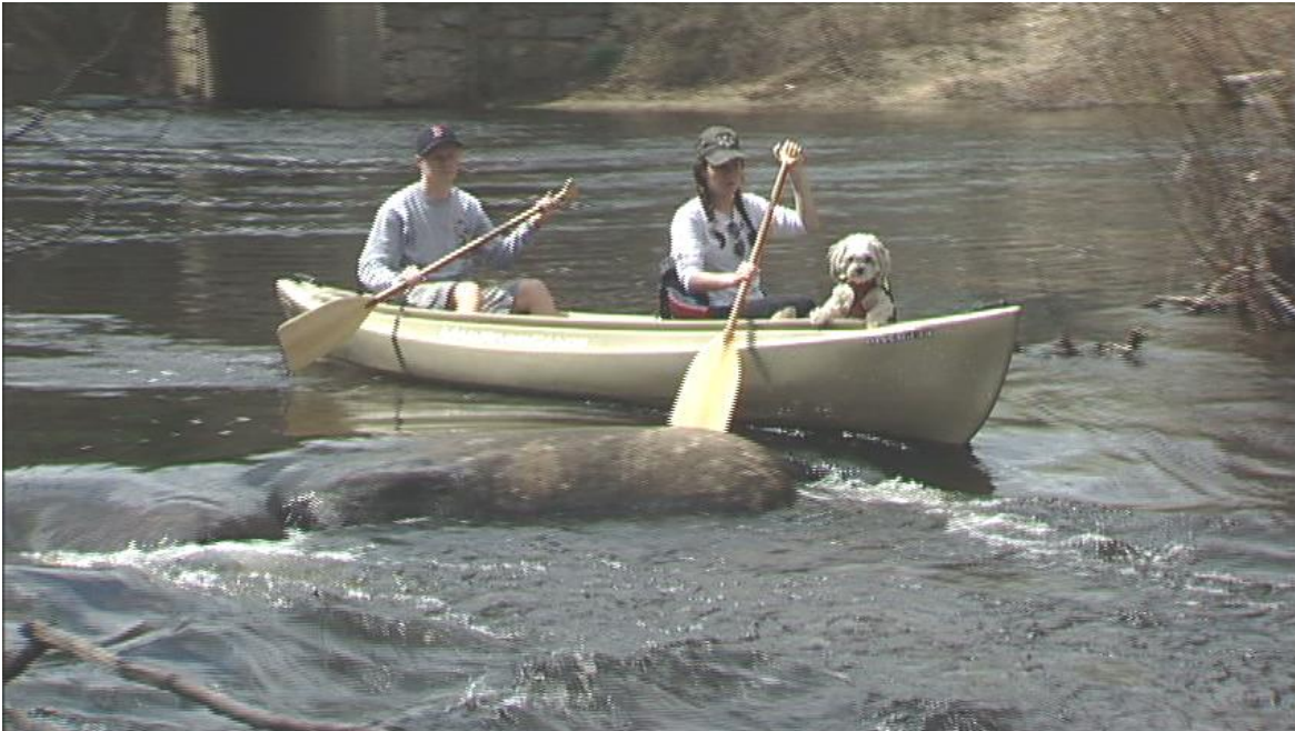
Visitors have a dog-gone good time on the river, photo by Breakaway Media.