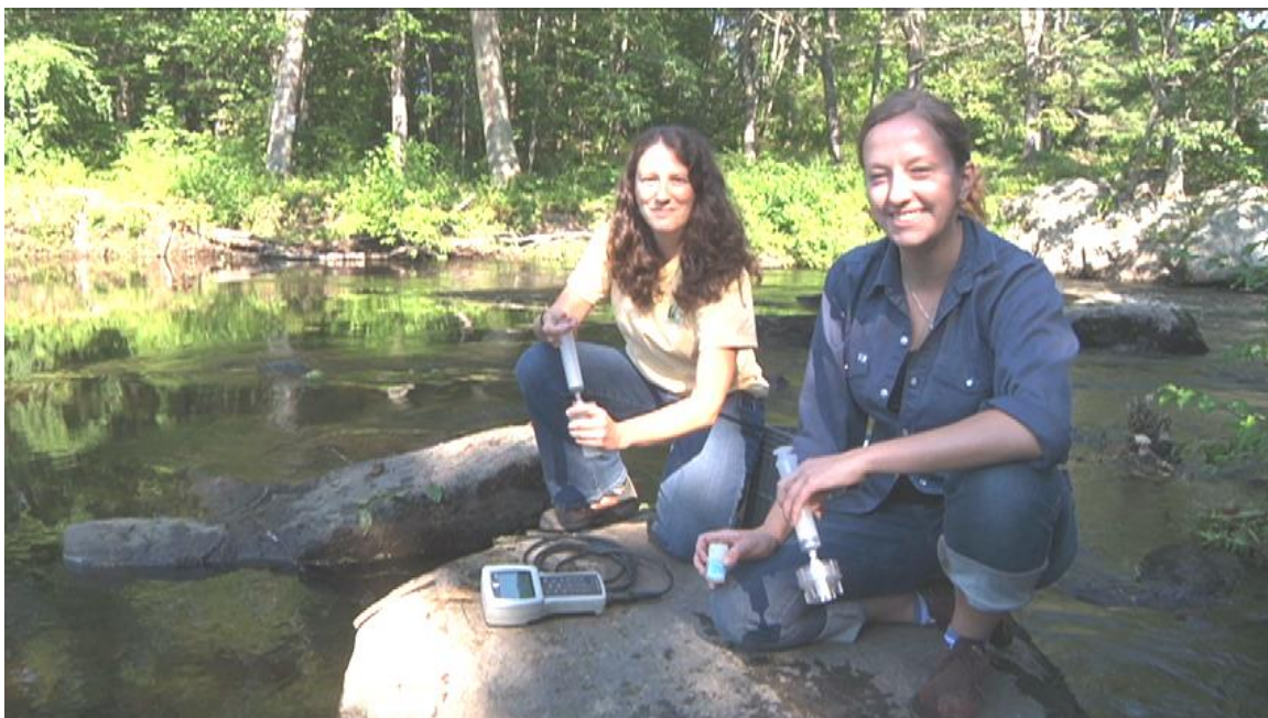
Scientists test the water, photo by Breakaway Media.