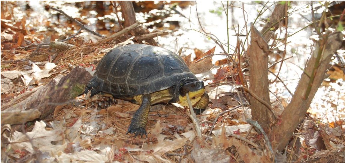
Blanding's turtle rests by a vernal pool, photo by Jon Bromley.