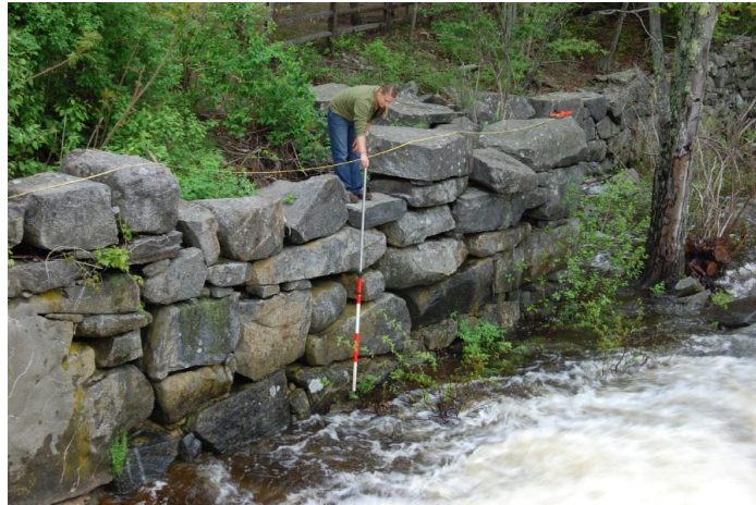
Historian documents the Wiswall Mill foundation in Durham prior to construction of the fish ladder, photo courtesy of NRCS.