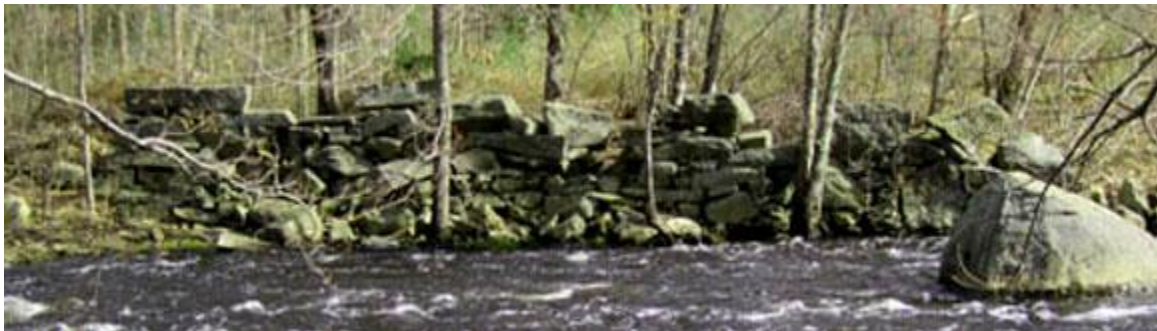
Remains of the Folsom Mill in Epping.