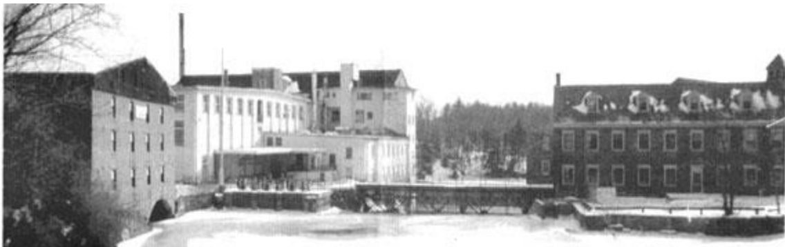
Newmarket Manufacturing Company, Photo courtesy of Newmarket Historical Society