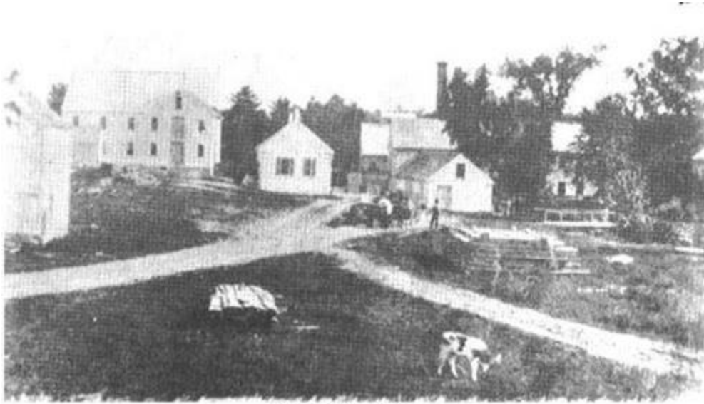
Mill at Wiswall Dam

The mill complex at Wiswall's Falls in Durham was originally constructed in 1835, when brothers Moses and Issachar Wiggin built a wooden dam and sawmill on the river. Recognizing that water wheels were no longer the technology of choice, they installed turbines that more efficiently captured the flow of water. They built other small mills on the site to take advantage of the abundant water power. Over the years, the mills here produced many goods: lumber for buildings and ships, flour, gingham cloth, knives, hoes and pitch forks, wooden measures, nuts and bolts, bobbins, axe handles, carriages and sleighs, chairs, and matches. In 1853, a large paper mill was added to the site and sold to Thomas Wiswall & Co. for the manufacture of wall paper. In addition to his own grand house, Wiswall built houses for the mill workers and added several more work buildings to the site. For years, Wiswall and the men and women at the paper mill oversaw the production of a ton of paper per day.