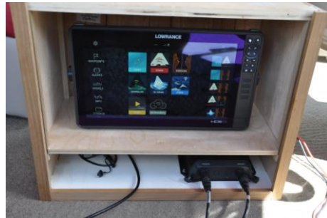
Sonar unit showing display and 3D module