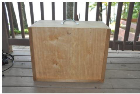
Sonar unit in its “carrying case”

The equipment was ordered in mid May 2020 and delivered in late May. A “portable” case was built for the sonar and related equipment and an experimental mount was made for the transducers out of scrap material and mounted in such a way that the equipment could easily be moved to another boat when needed.