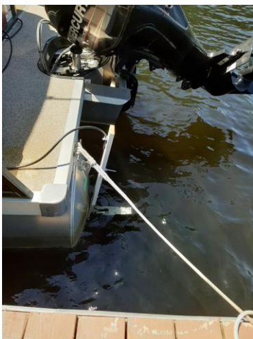
Transducer mounted on pontoon boat