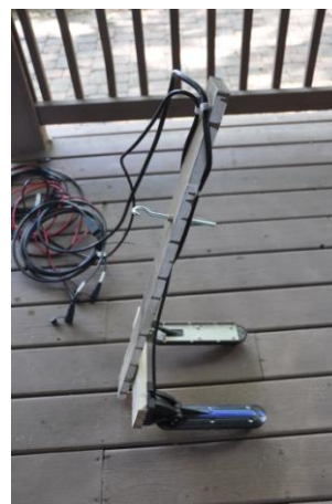
Transducers Blue unit is normal down scan, 2d, and side scan. Other unit is side scan and 3D.