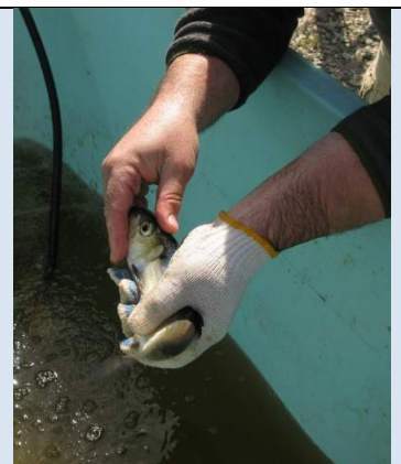
Alewife passing through.

The Lamprey River continues to see good numbers of river herring (80,000 alewives in 2021!) returning from the ocean to spawn in the abundant freshwater habitat upstream; however, due to continuing stressors, such as dams and improperly-sized culverts, direct and indirect overfishing, and habitat loss, the river herring fishery in New Hampshire was closed in 2021 and remains closed.