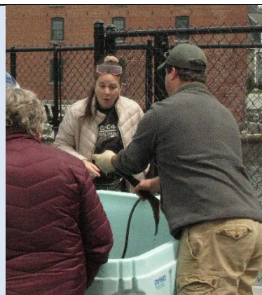
Say hello to a sea lamprey!