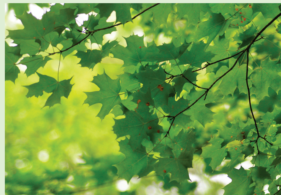
Examples of bark and leaves from a sugar maple tree.