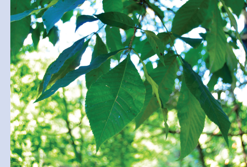
Examples of bark and leaves from a shagbark hickory tree.