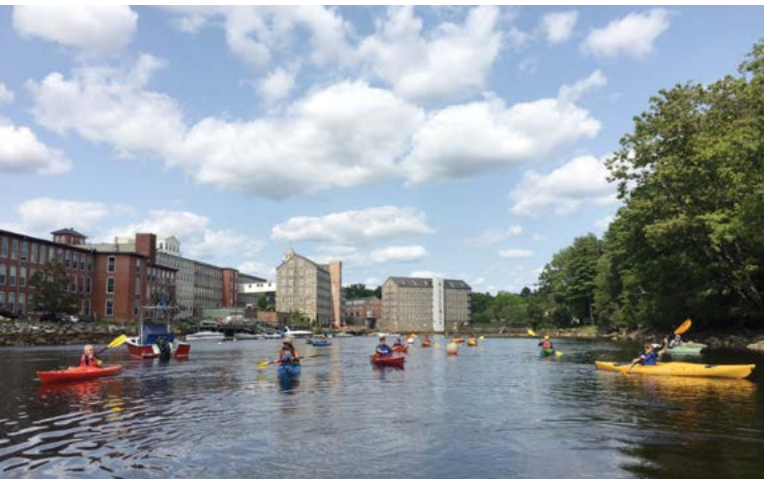
Paddlers enjoy Newmarket's historic mills that were once powered by the Lamprey River. PETER SAWTELL

Newmarket was incorporated in 1727 and was called Lampreyville for a time. Textile mills were a prominent feature of Newmarket in the 1800s and the Newmarket Manufacturing Company built and controlled dams as far away as Northwood to provide water power for the industries and town. Many of the historic mill buildings have been converted to modern uses such as apartments and small businesses.