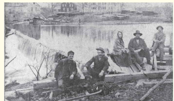
Historic Wadleigh Falls circa 1900.