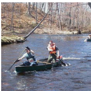
Lamprey River Canoe Race