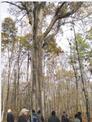
Hikers can find some magnificent old trees at George Falls Woods. S. PETERSEN