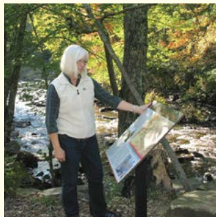
A visitor learns about history at Mary Blair Park in Epping.

Kiosks at many sites describe the history of use at each site and also of the towns in general. These will take you through time from the Native Americans, to the early settlers and the remains of their mill buildings, to the present day. Much of downtown Newmarket, with its large mill buildings, is listed in the National Register of Historic Places .