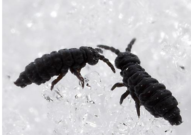
snow fleas

Snow fleas are able to remain active in winter due to natural, protein-rich anti-freeze. Scientists at Queens University in Canada have been studying the anti-freeze in hopes that it will enable longer storage times for transplanting human organs. According to an October 21, 2005 article in www.physorg.com/news7456.html , organs for transplant must be kept at the freezing point or slightly higher. If the organ can be stored at a cooler temperature, it can be preserved for a longer period of time. Once in the recipient's body, the organ warms and the anti-freeze breaks down quickly. The patient can then eliminate the protein and reduce the risk of antibody development.